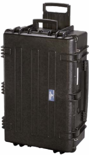
CASE-ICH3 MIL SPEC shipping case