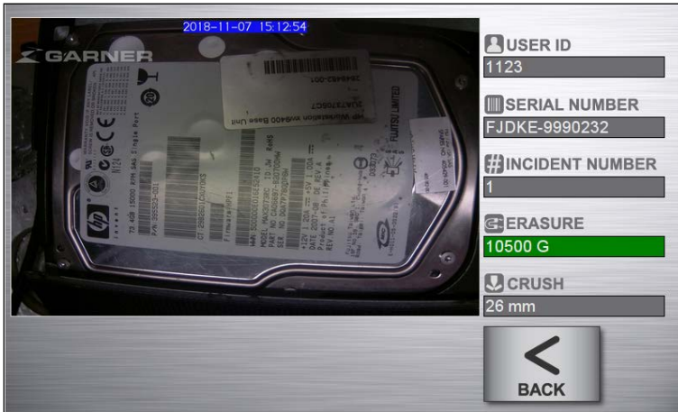
Proof of erasure image