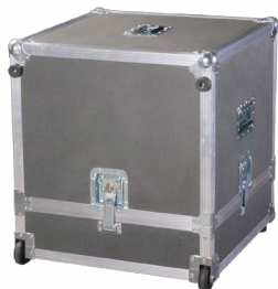
CASE-25SSDIC Transport Case