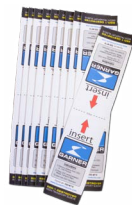
SSD-MT media transport sleeves