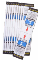
SSD-MT media transport sleeves