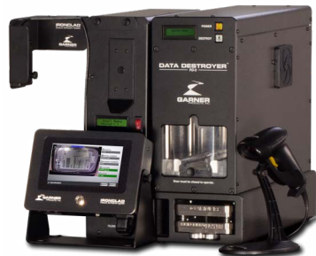
IRONCLAD Erasure Verification System