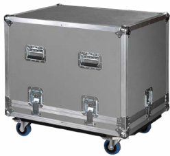
CASE-TS1XTIC transport case